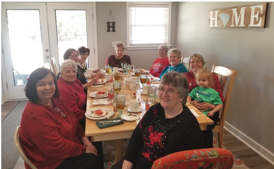
Ladies Outreach Christmas Luncheon

Our Ladies Outreach group hopes to meet monthly during 2022. The first meeting will be on Wednesday, January 19th, at 10:30 a.m. The meeting dates may vary as the group works around doctor appointments for several of the ladies. Tentative dates for upcoming meetings are February 16th and March 16th. These dates may change after the January meeting so please watch the bulletin for future updates.