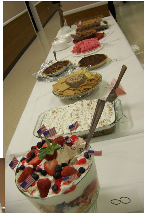
Dessert entries from 2020.