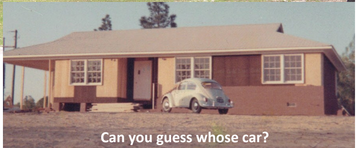
Can you guess whose car?