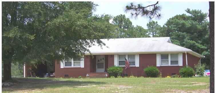
Original parsonage was built in the 1960s.